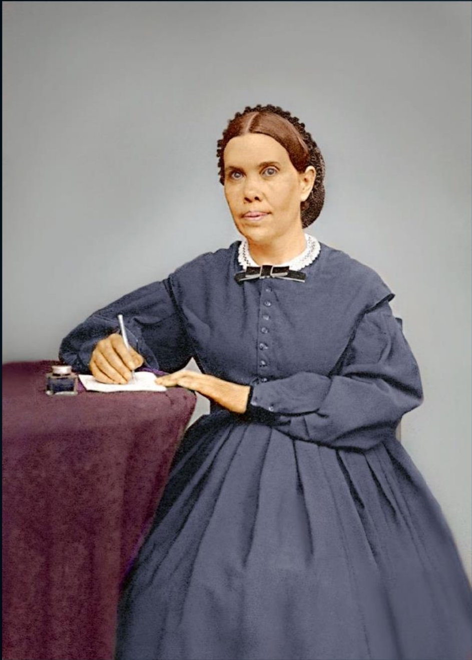
Ellen White Circa 1864 Colorized