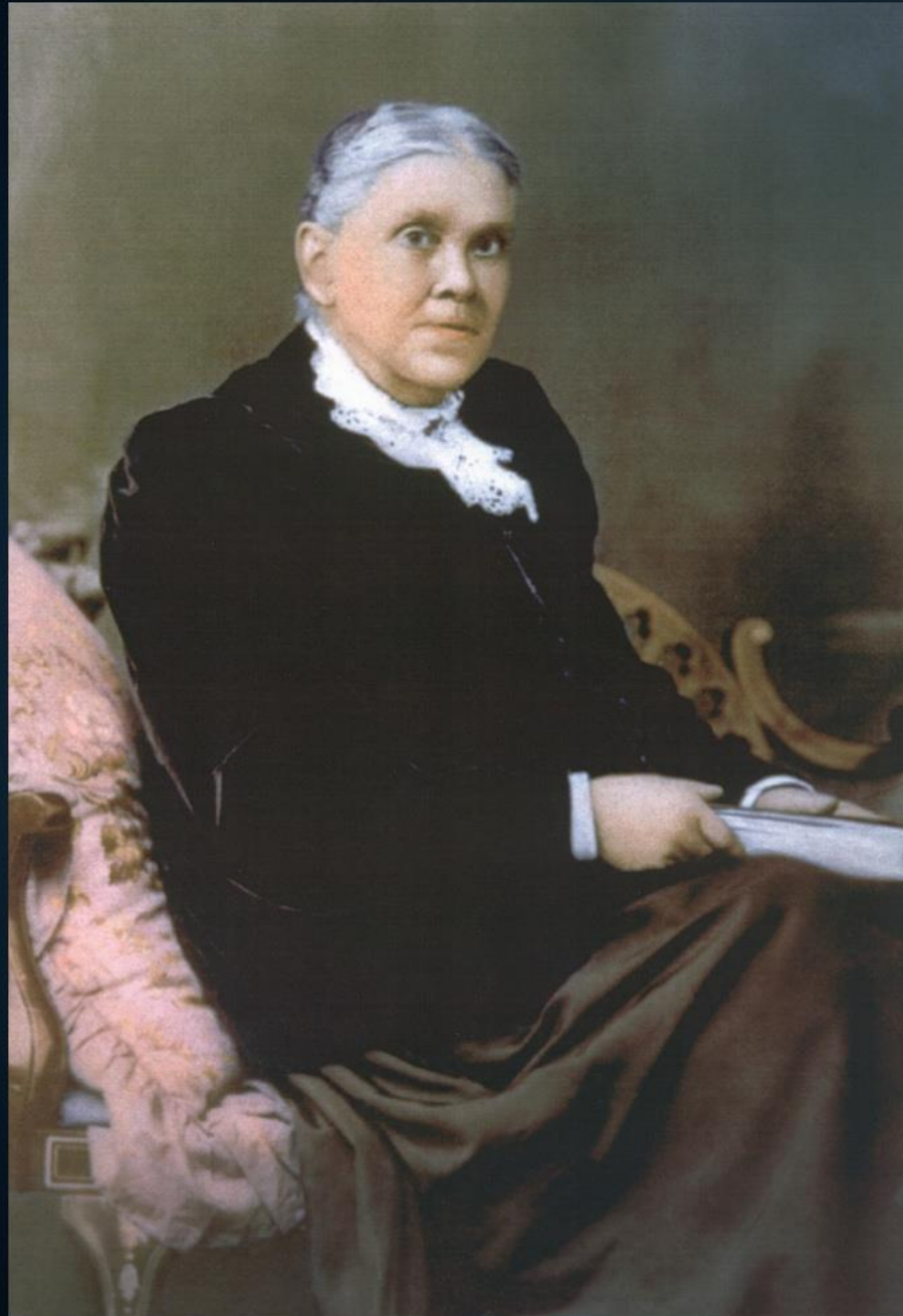
Ellen White Circa 1899