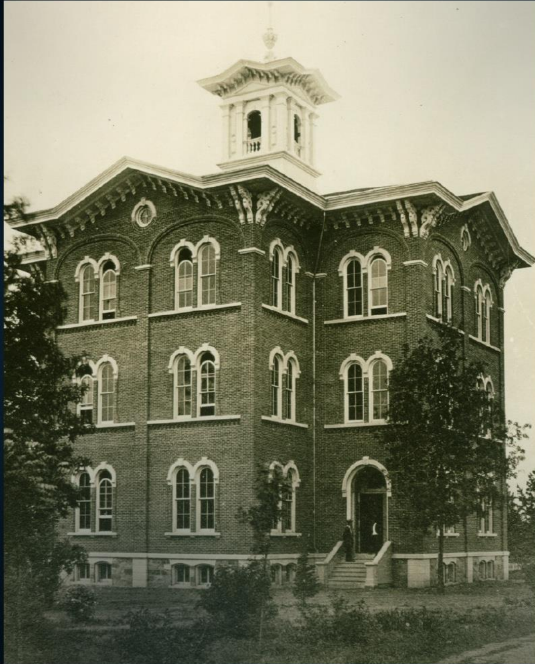
Battle Creek College