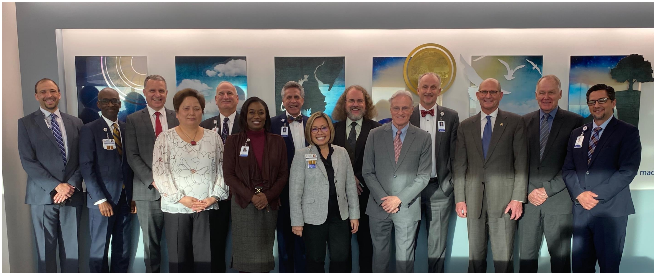
GC Strategic Planning & Adventist HealthCare Leaders