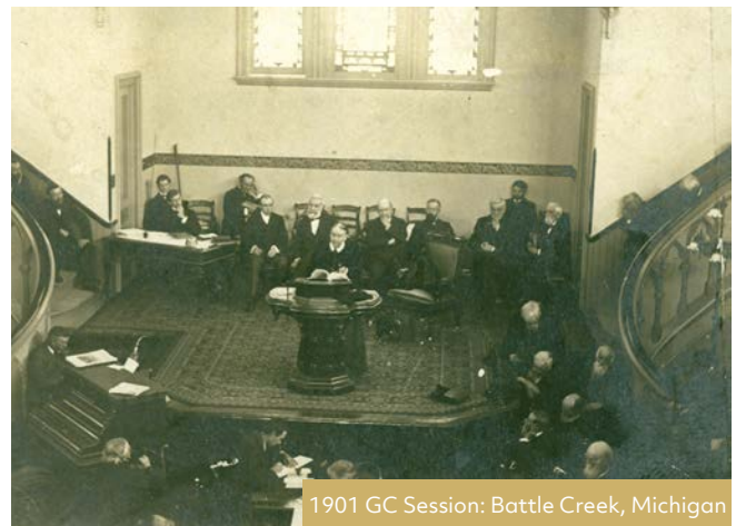
1901 GC Session: Battle Creek, Michigan

*Visit the official 2020 GC Session website, session.adventist.org