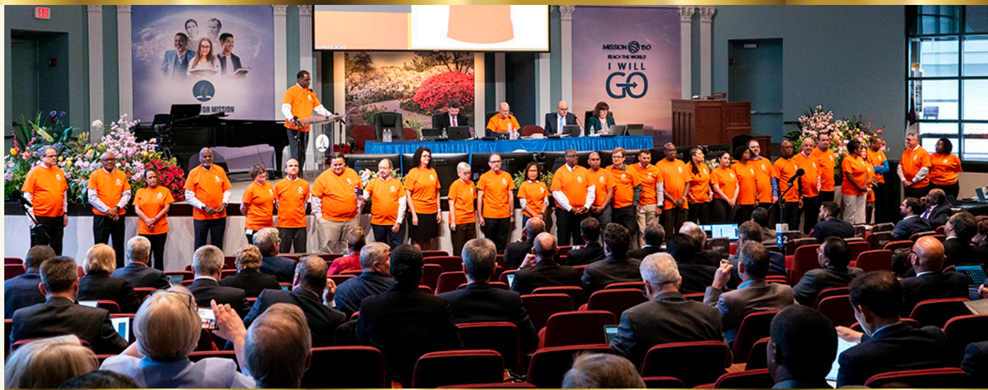
I Will Go!: Treasury staff are dedicated for a special mission trip to St. Croix.

of Influence focusing on outreach for youth and young adults. Preparing the way for the mission trip were four evangelists who presented programs across the island. As of the time of the treasury team's dedication at Spring Meeting, 62 people had already been baptized as a result of these evangelistic meetings. Note: At the end of the two-week event, a total of 105 baptisms took place. Read the follow-up report here .